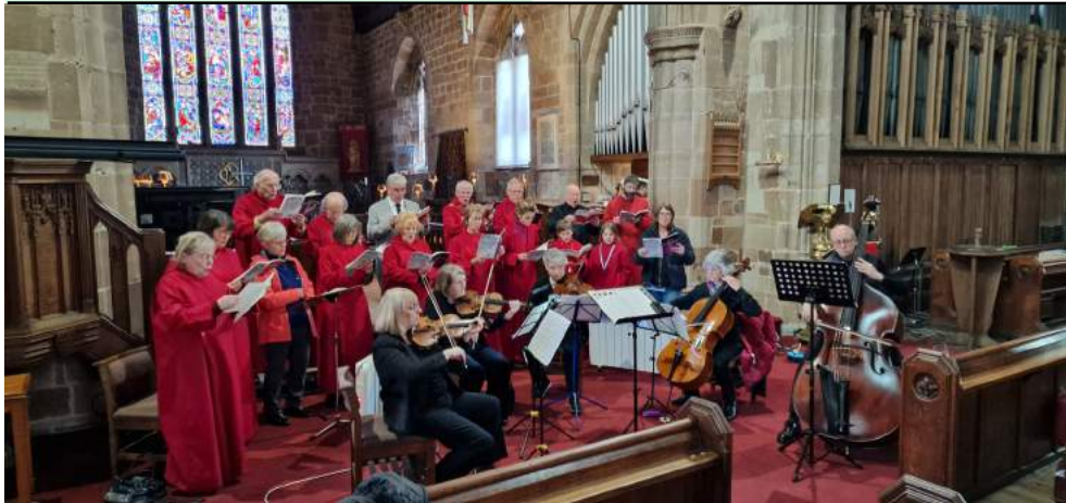
St John's choir and friends rehearse for a performance of Fauré's Requiem on Palm Sunday evening