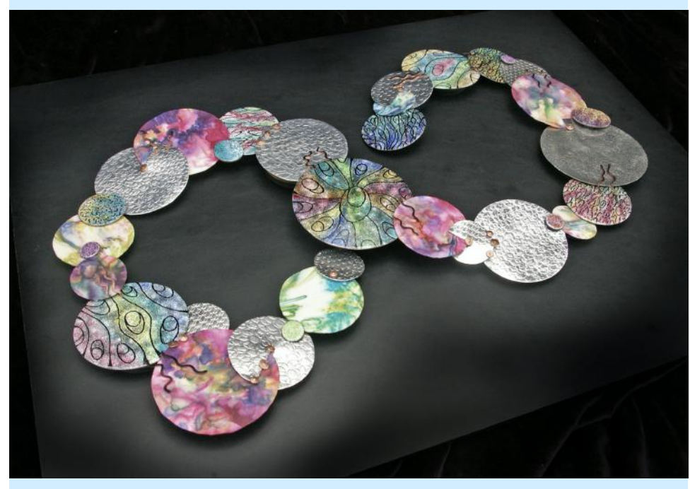
flat, but 3-dimensional, the shape rises and falls as it twists and turns in a sinuous organic way creating an overall form similar to the symbol for infinity. I deliberately left a space for a final circle, suggesting that further connections between us are possible.

Some of the parts are made of copper with kiln-fired enamel, others covered in hand-painted silk, some in aluminium, which I have imprinted Or find me on facebook -facebook.com/ with a pattern, and even one in hammered pewter. I felt that the variety of circles, with their different sizes and diverse materials mirrored our similarities and differences. The individual elements are joined together by either overlapping or intersecting reflecting our interaction. There are hidden, or more obvious connections in much the same way as we are connected, even if we are not always aware of it. 'Close Affinity' is not